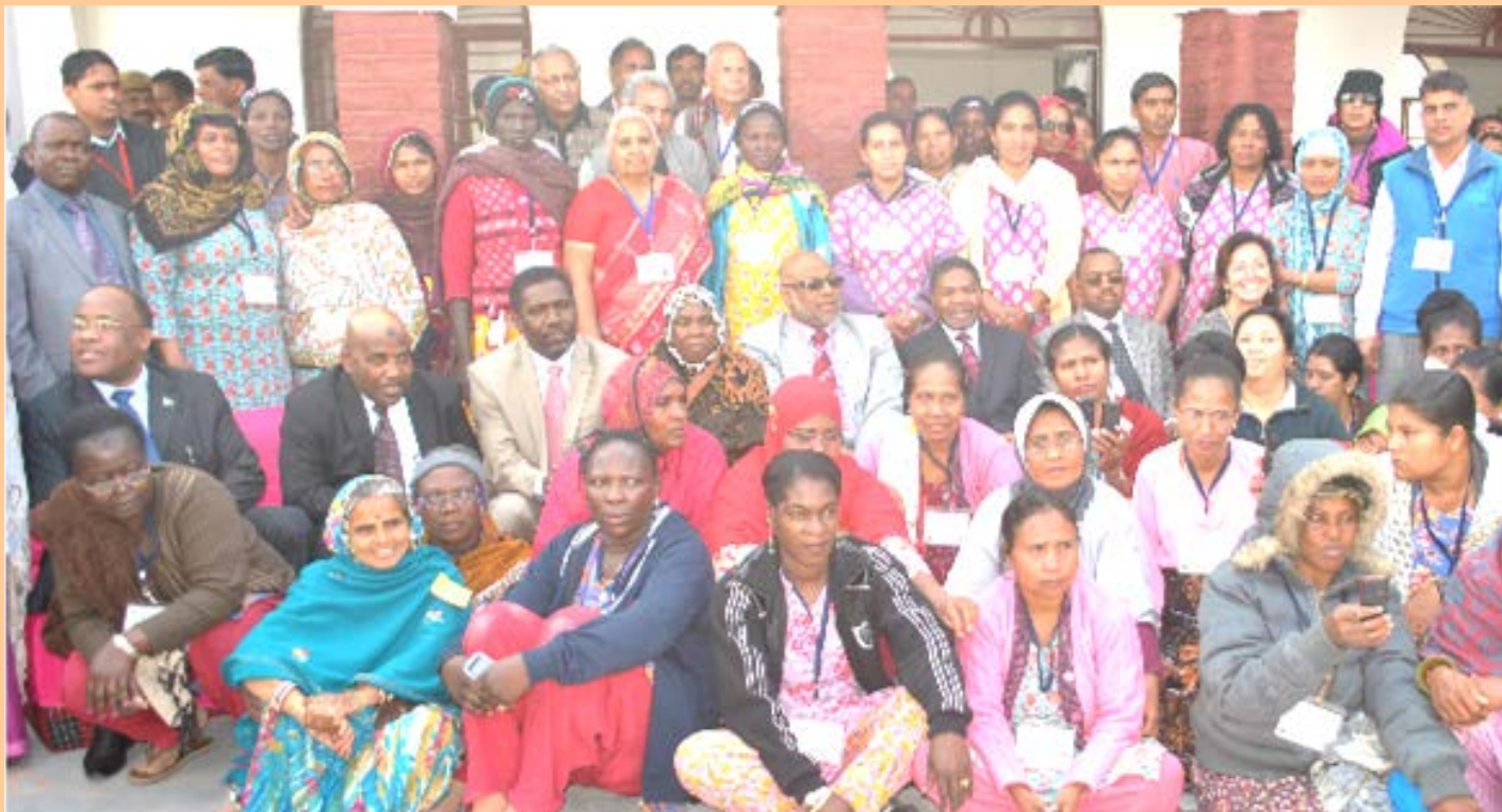
Barefoot College Participants of the XI ITEC Course

Apart from regular courses offered under the ITEC, special courses and training programmes are also conducted /scheduled at the specific request of partner countries. In recent years, special courses have expanded to new areas such as election management (at the International Institute of Democracy and Election Management (IIDEM), New Delhi), government performance management (with Cabinet Secretariat), mid-career training of civil servants (at National Institute of Administrative Research/National Centre for Good Governance NIAR/NCGG), Parliamentary Studies (Bureau of Parliamentary Studies), urban infrastructure management (Human Settlement Management Institute), fragrance and flavour studies (Fragrance and Flavour Development Centre), WTO related topics (Centre for WTO Studies, Indian Institute of Foreign Trade), etc. Also, some innovative courses are offered under ITEC, including one on solar technology for semi-literate and illiterate grand mothers from the Least Developed Countries at Barefoot College, Tilonia, Rajasthan .