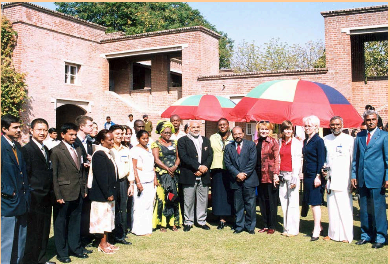
2005-06 ITEC participants with Shri Narendra Modi, the then Chief Minister of Gujarat, and the current Prime Minister of India

ITEC has created a large network of alumni across the continents who have become ITEC torch-bearers in their respective countries and in the process, developed a powerful cultural bridge between India and the country concerned. ITEC alumni have carved a niche for themselves, with many of them becoming ministers, senior diplomats, academics, government officials and leading entrepreneurs. As a result of different activities under ITEC, there is now a visible and growing awareness among other countries about the competence of India as a provider of technical know-how and expertise. Over the years, these programmes have generated immense goodwill for the country.